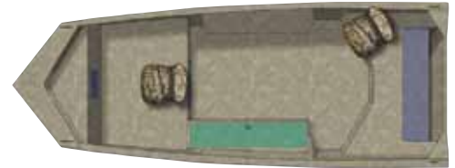
1650 Retriever DS

■ Storage Compartment ■ Rod Storage ■ Livewell