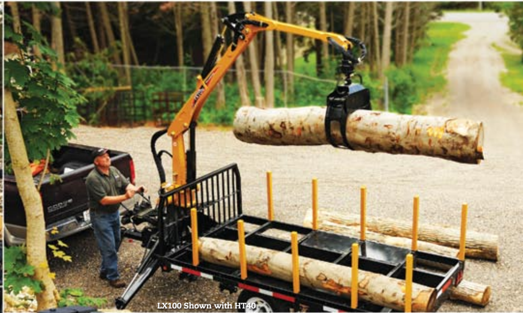
LX100 Shown with HT40