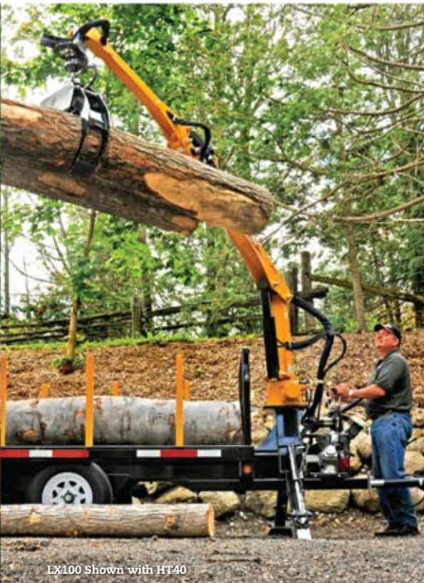
LX100 Shown with HT40