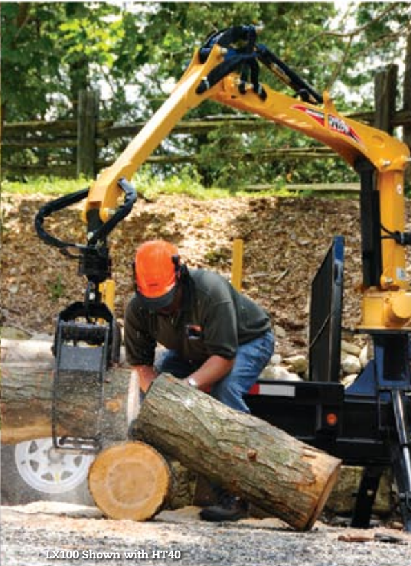
LX100 Shown with HT40