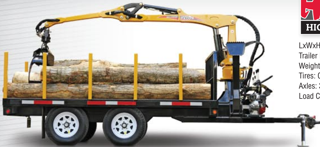
LX100 Shown with HT40

LxWxH: 19' 2" x 72" x 90" Trailer Bed Length: 10' 6" Weight: 2150 Lbs. Tires: Carlisle ST205/75R14 Axles: 3500# Load Capacity: 4760 Lbs.