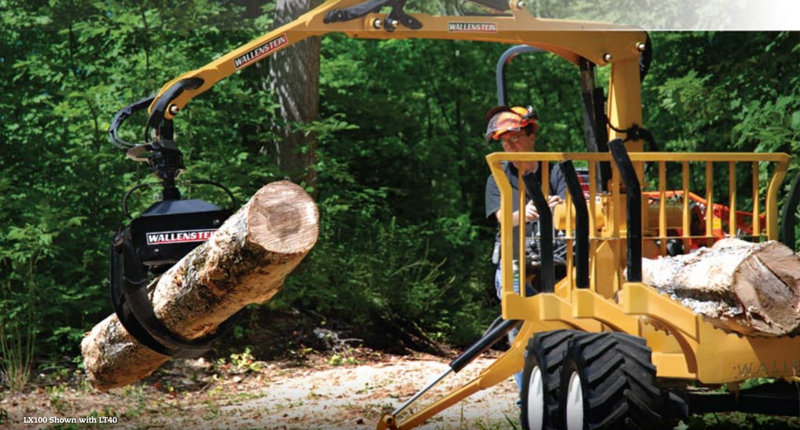
LX100 Shown with LT40