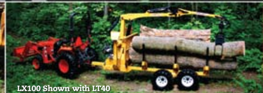
LX100 Shown with LT40

8-ply Traction tires provide grip and durability on rough trails while the Walking Beam axles absorb bumps and ruts for smooth trailing.