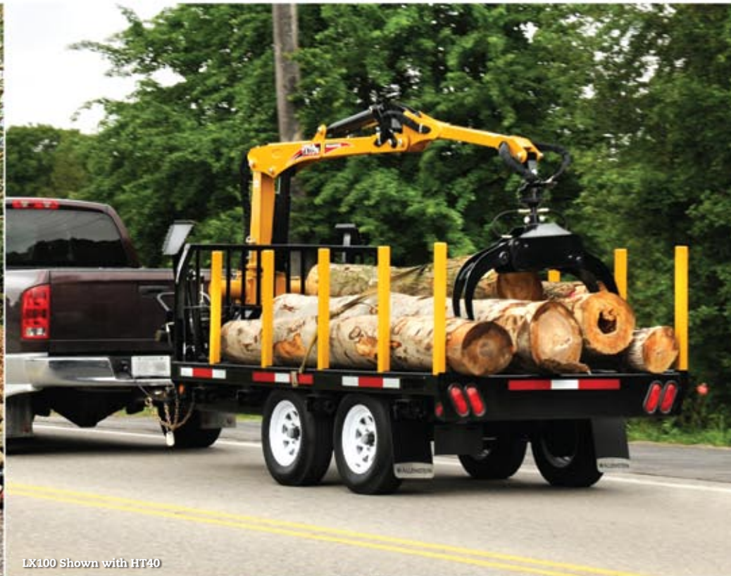
LX100 Shown with HT40