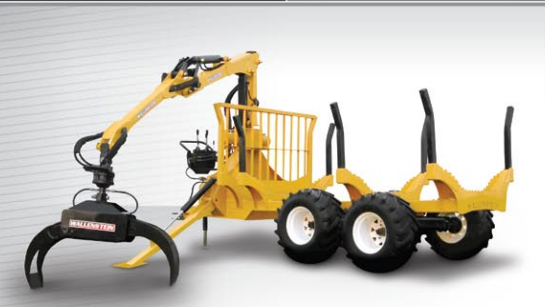
LX100 Shown with LT40

Serrated edges minimize load shifting during transport.