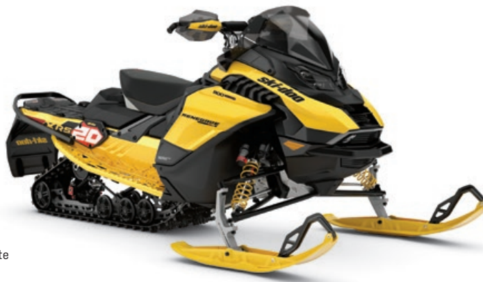
RENEGADE X-RS 900 ACE TURBO R SHOWN

A hard-charging, high-performance machine with the most advanced features and technology.