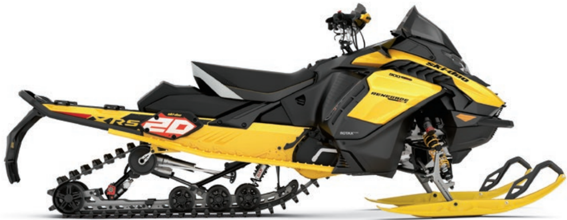
RENEGADE X-RS 900 ACE TURBO R SHOWN

Extreme capability, extreme durability shocks for control in the toughest conditions. Easy adjust-equipped for dialed in compression.