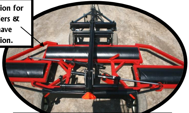
Drums are 30" x 3/8" wall pipe with 5/16 reinforced end plates. (6) 2" greaseable pins for wing hinge.

12' main section for up to 43' rollers & 44' and up, have 14' main section.