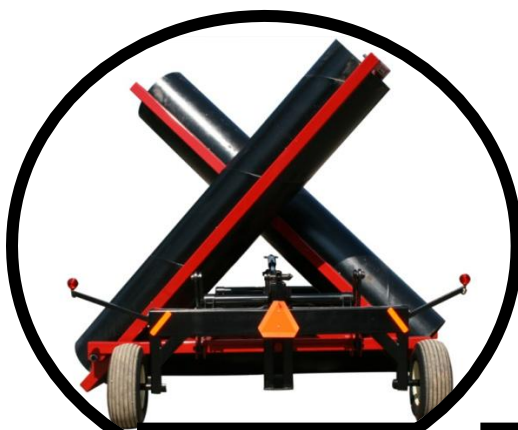
Compact X-Fold design means easy storage and maneuverability.

3-1/2" x 27" Raise & Lower Lift Cylinders