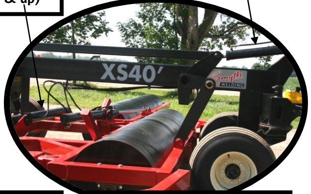
Over - centering four-bar lift assembly requires no lock-up's for transport.

Available widths: 30' to 47' Weight per foot: 280 lbs/ft Transport width: 14' (over 44' is 16') Transport height: 9' 6" to 14'