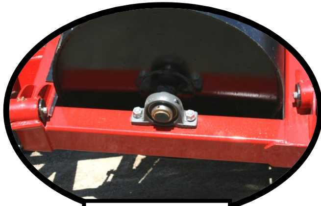
Heavy duty 2" bearings with ductile housing.

12' main section for up to 43' rollers & 44' and up, have 14' main section.