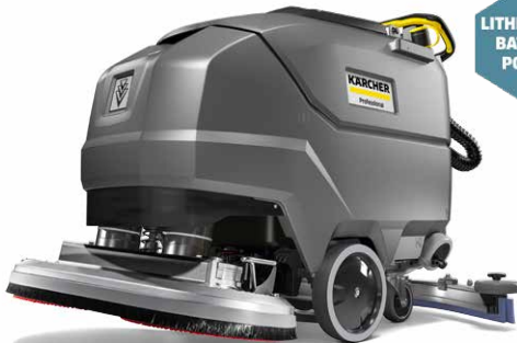
BD 70/75 W BP CLASSIC