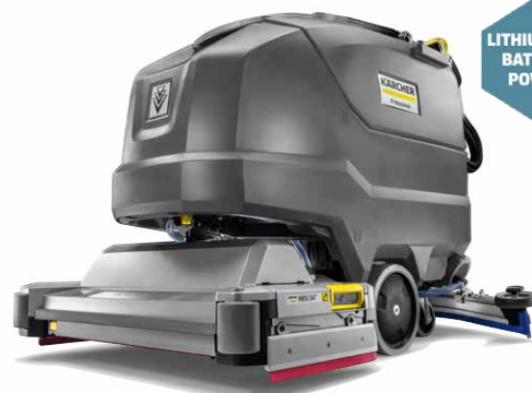
BR 85/100 W BP CLASSIC