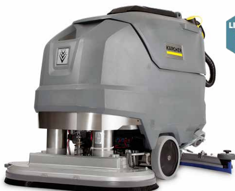
BD 80/100 W BP CLASSIC