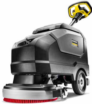
BD 35/15 C BP CLASSIC

Designed to meet all of your scrubbing needs without breaking the bank. With the BD 70/75 W Bp Classic, BD 75/75 W Bp Classic, BD 80/100 W Bp Classic, BD 50/55 W Bp Classic and BD 50/50 C Bp Classic scrubbers, Kärcher presents its Classic Scrubber line. These machines are battery-operated, have a very solid construction, and are characterized by their simple operations.