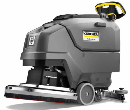
BD 50/55 W BP CLASSIC