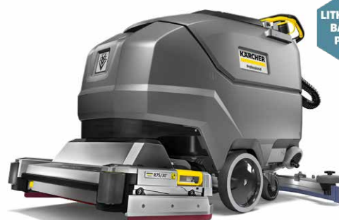
BR 75/75 W BP CLASSIC