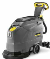
BD 43/25 C BP