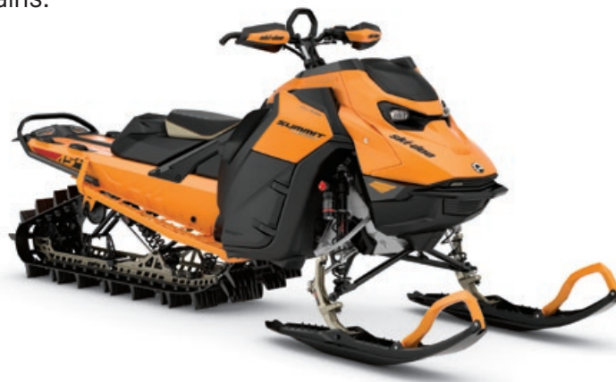
SUMMIT EXPERT 154 850 E-TEC TURBO R SHOWN

The ultimate precise and predictable deep-snow sled with features sharpened for most technical terrains.