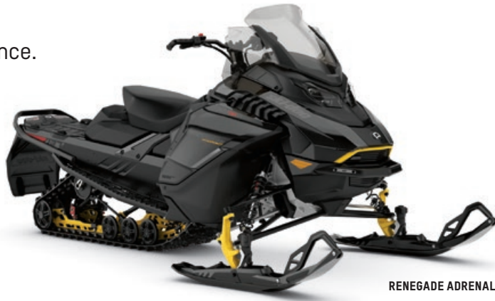
RENEGADE ADRENALINE WITH ENDURO PACKAGE 600RR E-TEC SHOWN

Adventure-ready with top-tier technology, comfort and performance.