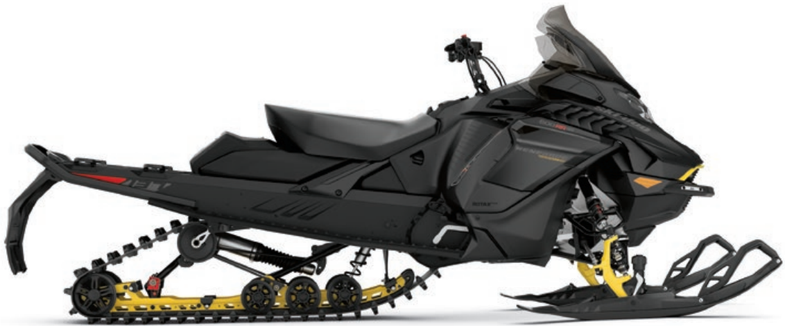
RENEGADE ADRENALINE WITH ENDURO PACKAGE 600RR E-TEC SHOWN

Incredible power and unmatched dynamic response with exclusive E-TEC direct-injection technology. Plasma-coated, mono-block cylinders are used for exceptional durability, while the precision of E-TEC injection means you get excellent fuel and oil economy.