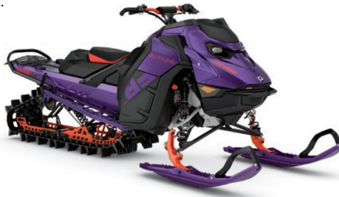
FREERIDE 154 850 E-TEC TURBO R SHOWN