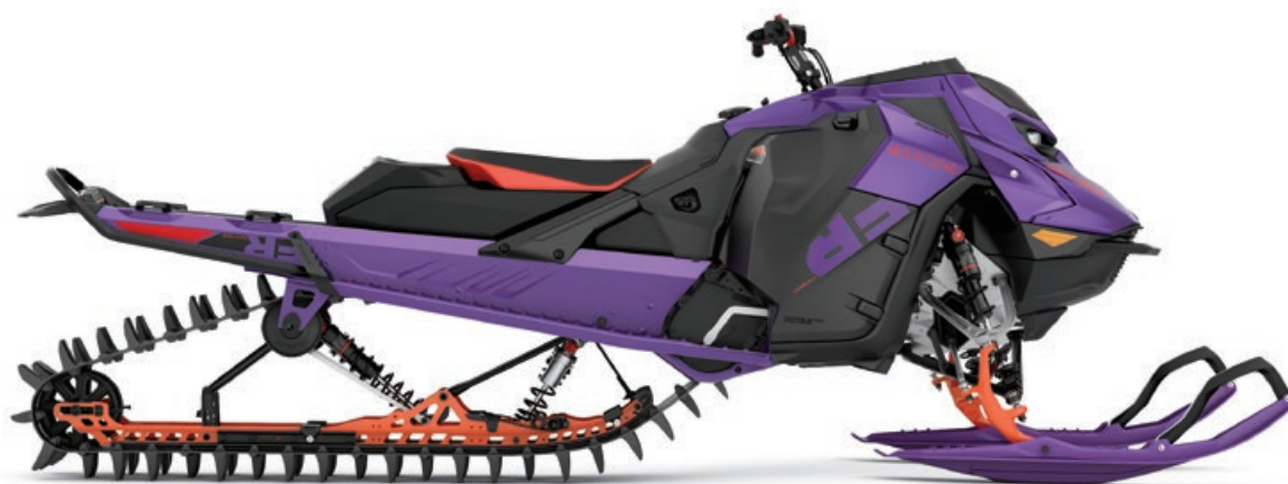
FREERIDE™ 154 850 E-TEC TURBO R SHOWN

Unleash the wheelie monster with the 147x3.0 track—agility meets traction for freestyle fun. Adjustable limiter strap gives you control when terrain gets tough. Go full send or rein it in—your ride, your rules.