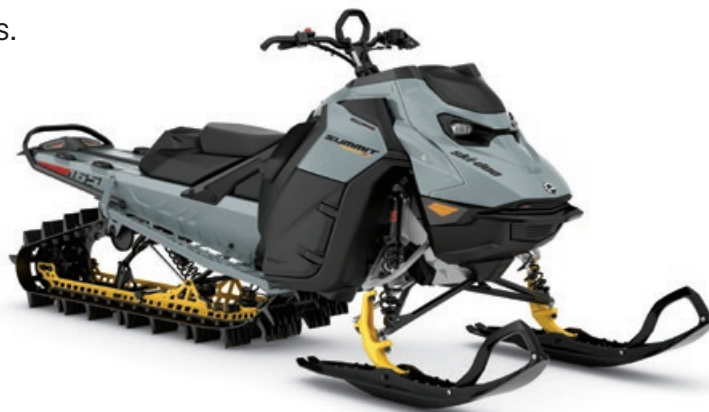
SUMMIT X 154 850 E-TEC® TURBO R SHOWN

Effortless throughout the day, the Summit® X® is the lightest, most agile and nimble of its family with an unmatched degree of playfulness.