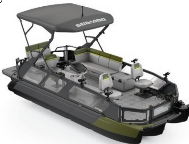
21' - 300 model shown

Fish on! A serious fishing boat that makes no sacrifices on family fun.