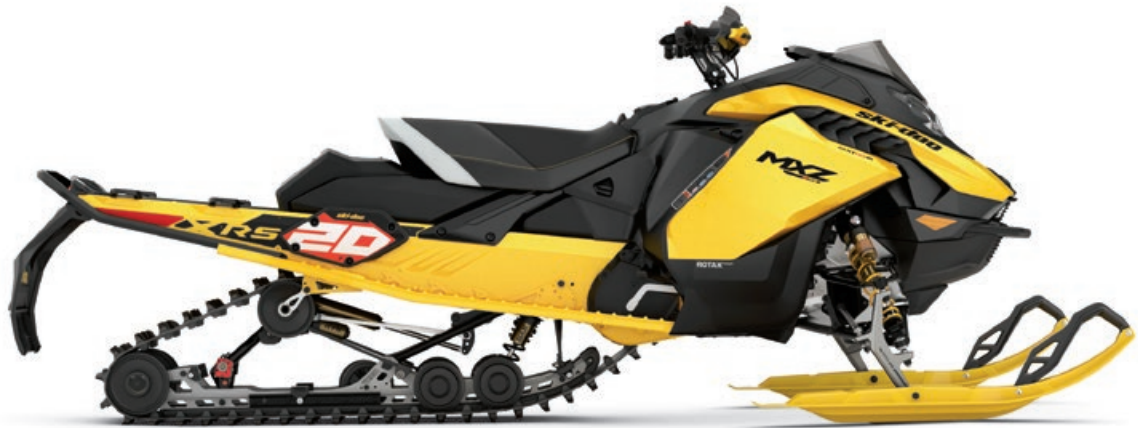
MXZ X-RS WITH COMPETITION PACKAGE 600RR E-TEC SHOWN

Conquer every inch of the most challenging trail conditions with unbreakable confidence with race-inspired RAS RX front suspension. Designed specifically for rough trail performance with less chassis roll for unrivaled cornering stability.