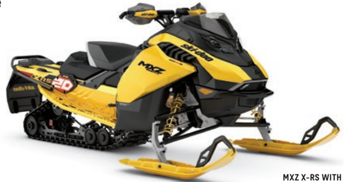
MXZ X-RS WITH COMPETITION PACKAGE 600RR E-TEC SHOWN