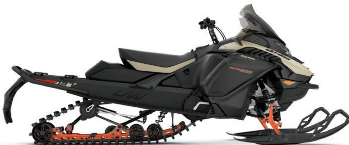
RENEGADE ADRENALINE 900 ACE TURBO R SHOWN

Built upon the same principles rMotion suspensions are renowned for, and then some. Completely redesigned for unmatched big bump absorption and incredible comfort. Longer front arm with exclusive adjustable angle design ideally mates with RAS X front suspension creating superior cornering on-trail.