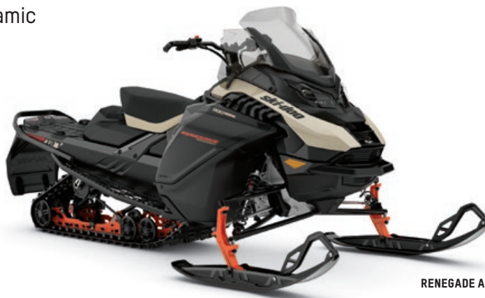
RENEGADE ADRENALINE 900 ACE TURBO R SHOWN

For the experienced trail rider who wants a longer track with great traction to bridge bumps with dynamic 4-stroke engine options.