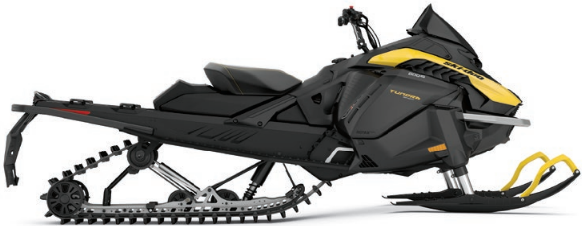
TUNDRA SPORT 600 ACE SHOWN

Industry-exclusive telescopic front suspension enables a large, flat belly pan for exceptional deep snow flotation.