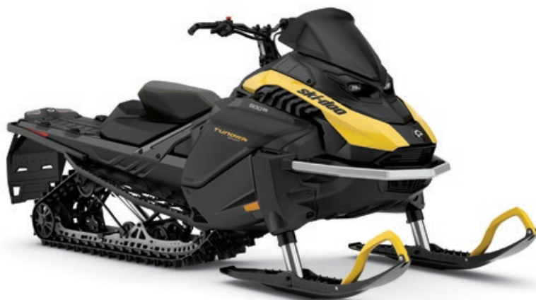
TUNDRA SPORT 600 ACE SHOWN

Economical, nimble and fun light-utility vehicle, now on the REV Gen5 platform.