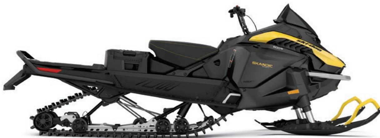
SKANDIC SPORT 600 EFI SHOWN

Perfectly balanced vehicle dynamics deliver unmatched versatility that's agile and capable both on- and off-trail. With increased travel for a more capable and comfortable riding experience for performance both with and without a load.