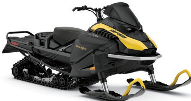
SKANDIC SPORT 600 EFI SHOWN

The best 20-inch utility value in snowmobiling, now on the REV Gen5 platform.