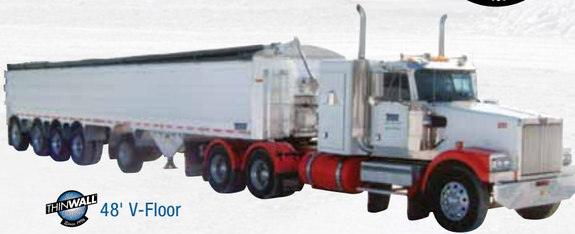
THINWALL 48' V-Floor