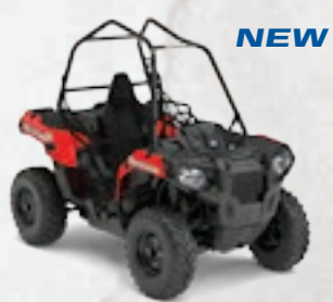
32HP POLARIS ACE® 500 INDY RED