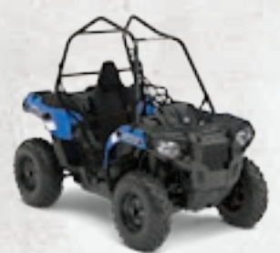
45HP POLARIS ACE® 570 VELOCITY BLUE