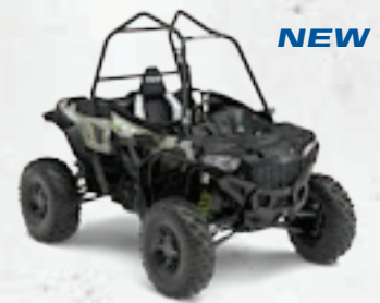
78HP POLARIS ACE® 900 XC MATTE SILVER PEARL

FOR COMPLETE LIST OF COLORS & MODEL SPECS, SEE PAGE 14.