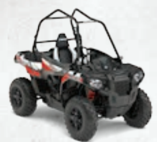
45HP POLARIS ACE® 570 SP TITANIUM MATTE METALLIC