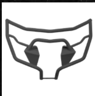
WZ-AZF-090 FRONT BUMPER