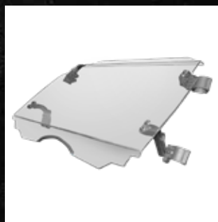
CF-AZF-830 TILT WINDSHIELD