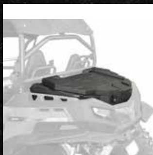
AC-LC03-RB0X-02 REAR CARGO BOX