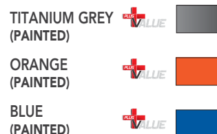
Photo for illustrative purposes only. Subject to change without notice. Details in store.