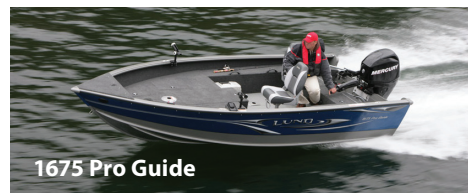
1675 Pro Guide