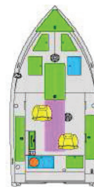
1675 Pro Guide