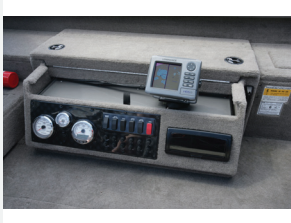
Electronics command center