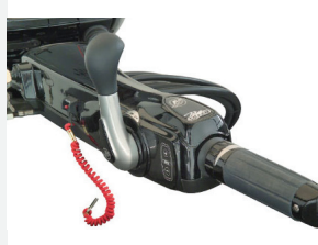
Big tiller handle (optional)