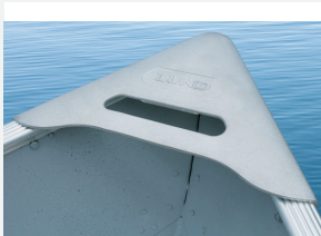
Bow and corner castings