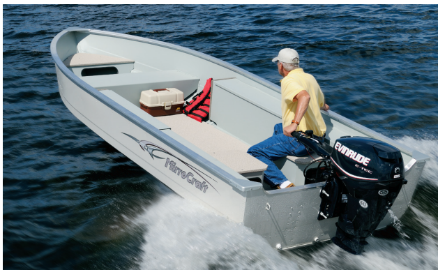
3673 Laker shown

We're proud to introduce a new series of heavy duty fishing boats that are based on our classic hull design that has been seen on the water for decades. With the 3672 and 3673 we definitely made a good thing even better. We widened the beam on this legend to a full 74" wide to gain the needed elbow room desired by anglers today. Additionally we increased the bow depth and included much stronger gunwales. A number of options are available to improve your time on the water as well. The end result is a fishing boat that can withstand the rigors of day-in and day-out use. These two models are true workhorses and we didn't forget the performance as they are rated for 40HP and are design to carry a full 1250 lbs.