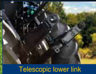
Telescopic lower link