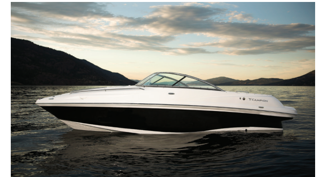
A23 I SC