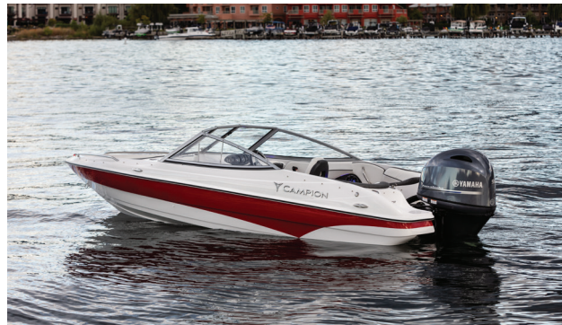
A16 OB BR