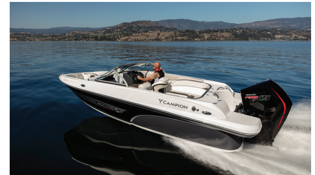
A20 OB BR

APEX hull Three-part interlocking uni-body fiberglass construction U-shaped cockpit interior with driver and passenger bucket seats and flip bolsters Large compound curve windshield Optional Chase graphics package