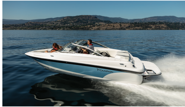
A18 I BR