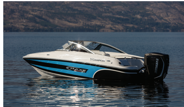
A18 OB BR

Large windshield with bow walk through Folding bucket seats Wrap around stern seating Uni-body deck joint Automatic bilge pump