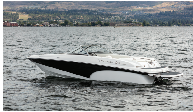
A20 I BR