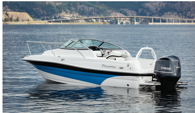
A21 OB SC