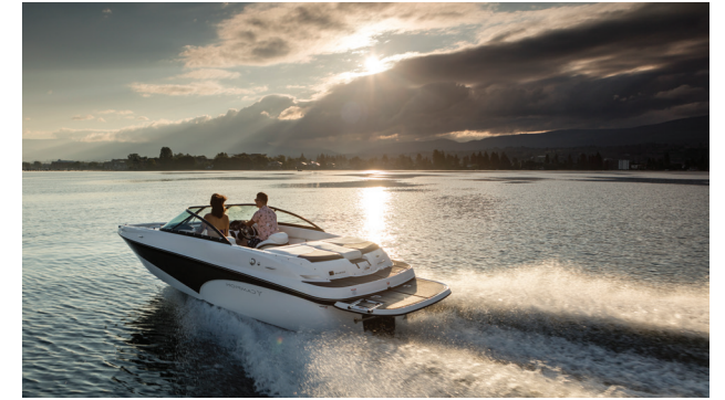
A23 I BR