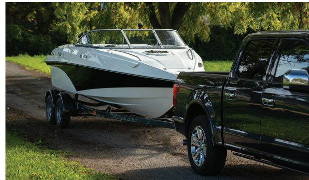
A20 I SC