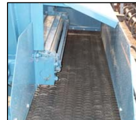
discharge belt conveyor (pto driven)