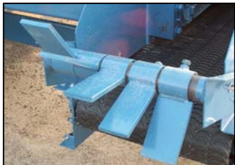
adjustable sand deflectors on discharge (optional)