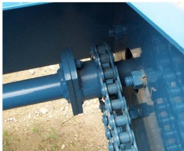
Shear bolt protection