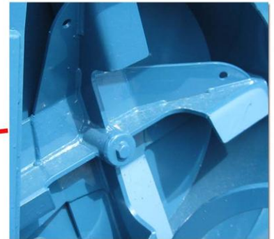
All blowers equipped with 4 blade fan