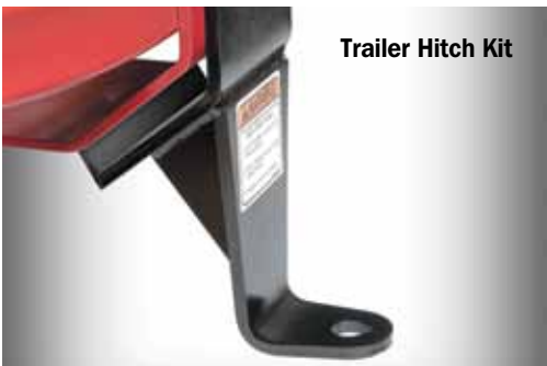
Trailer Hitch Kit