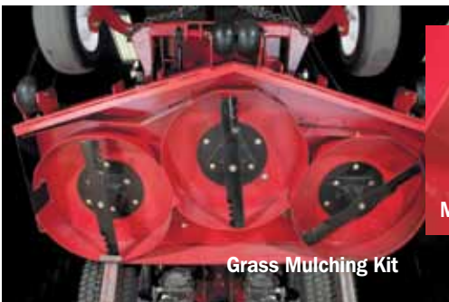
Grass Mulching Kit