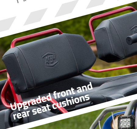
Upgraded front and rear seat cushions