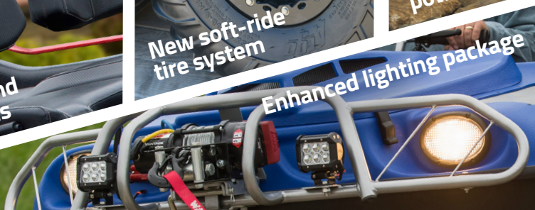
Enhanced lighting package