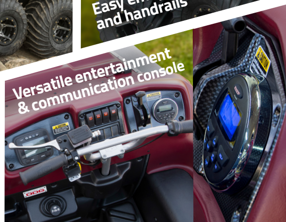
Versatile entertainment & communication console