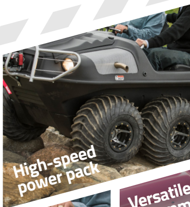
High-speed power pack