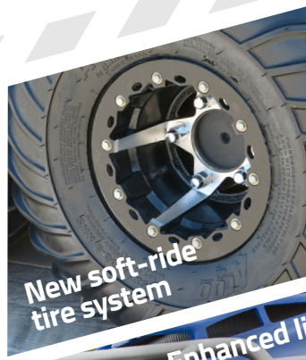
New soft-ride tire system