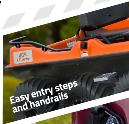
Easy entry steps and handrails