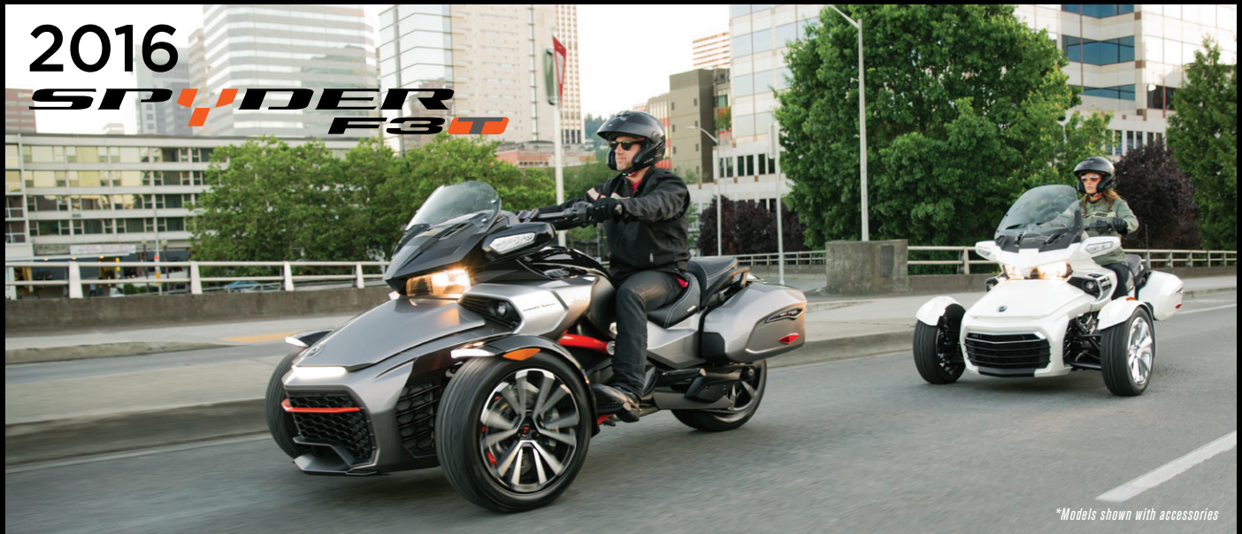
*Models shown with accessories