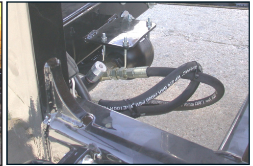
Accumulator and Valve