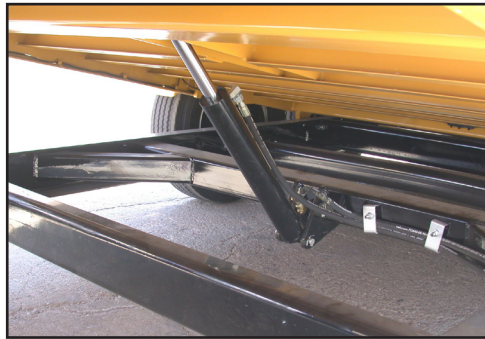
Tilt Cylinder & Frame