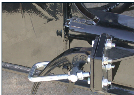
Deck Lock Latch