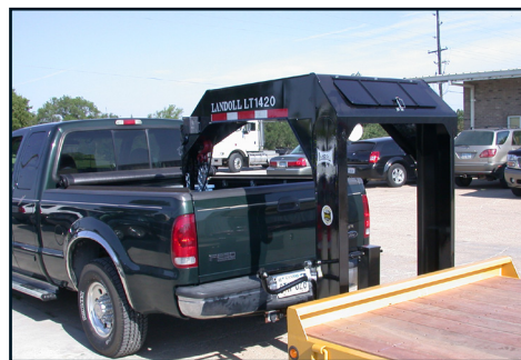
Gooseneck Connected to Hitch