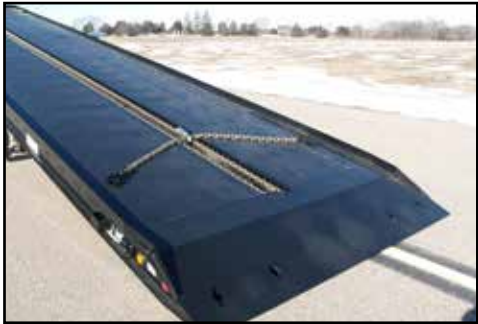
Bridle Chain with Twist Locks