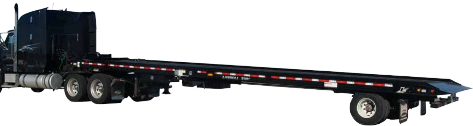
MODEL 330 Standard Equipment