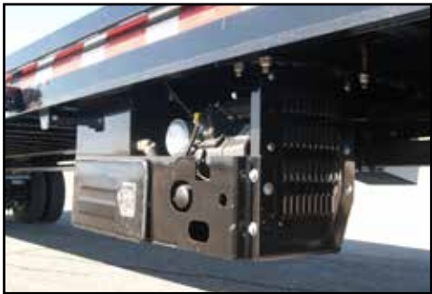
MODEL 330 Optional Equipment