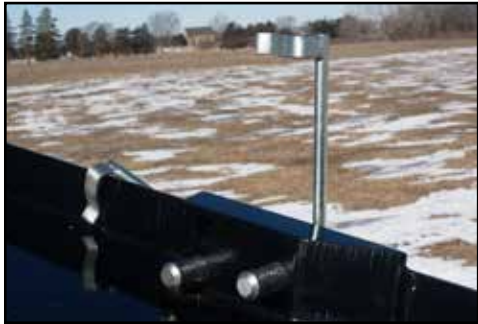
Front Side Pin Lock Down