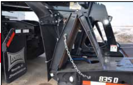
Standard Front Ramps in Transport Position