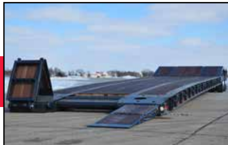
Standard Easy Fold Ramps in Load Position