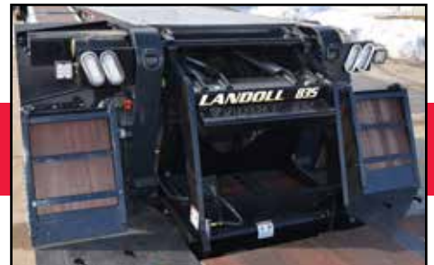
Optional Lights Shown