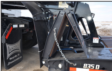
Standard Front Ramps in Transport Position