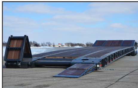
Standard Easy Fold Ramps in Load Position