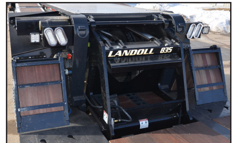
Optional Lights Shown