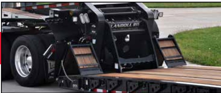
Standard Front Ramps in Transport Position