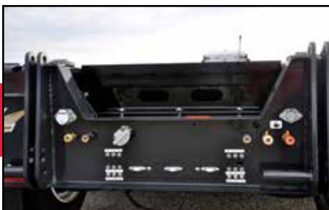
Centralized Grease System