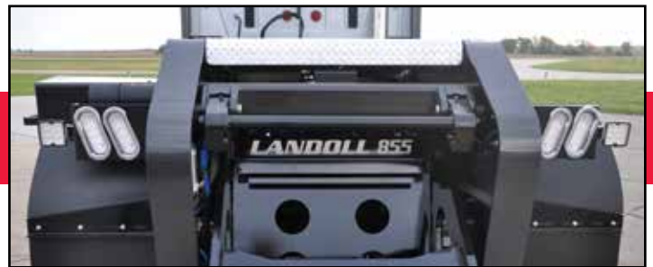
Optional Lights Shown