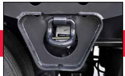
Standard Tie Downs / Chain Gotchas