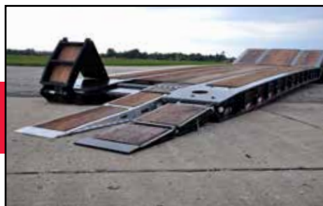
Standard Easy-Fold Ramps (Middle Ramp Optional)