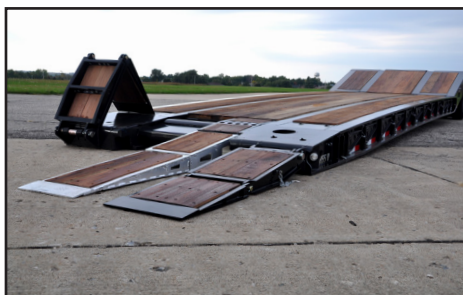
Standard Easy-Fold Ramps (Middle Ramp Optional)