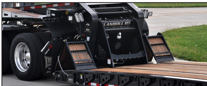
Standard Front Ramps in Transport Position