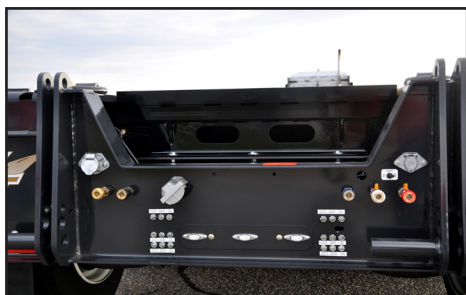
Centralized Grease System