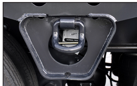
Standard Tie Downs / Chain Gotchas