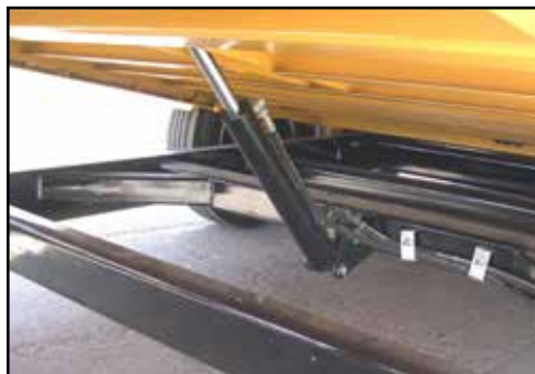
Tilt Cylinder & Frame