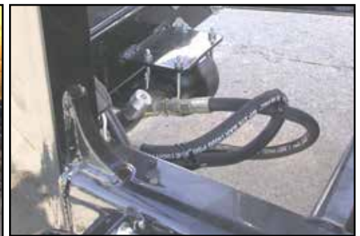
Accumulator and Valve