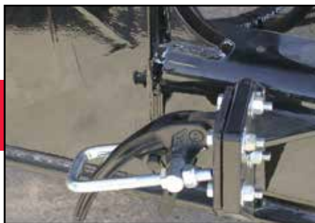
Deck Lock Latch