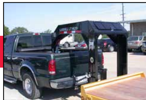
Gooseneck Connected to Hitch