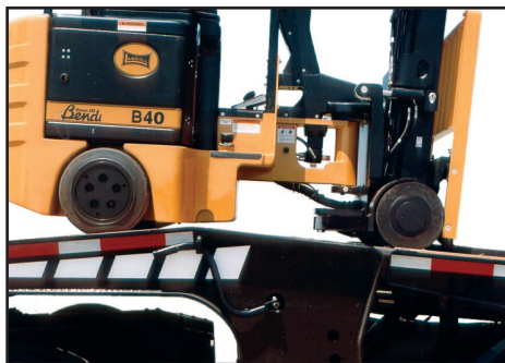
Plate is fully supported by the four main beams of trailer, allowing the entire trailer bed to become one single, even plane for safe loading from the ground or at dock height.