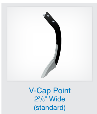
V-Cap Point 2 3 / 8 " Wide (standard)

The 3-section 2430 models fold to a narrow transport width of 16' for moving from field to field. Heavy-duty highway service tires on walking tandem axles provide trouble-free roading.