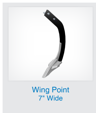
Wing Point 7" Wide