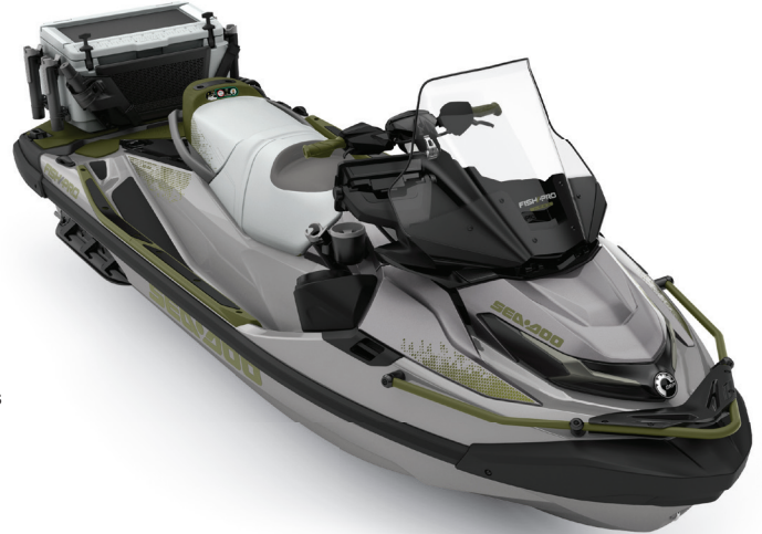
NEW Shark Grey and Nori Green