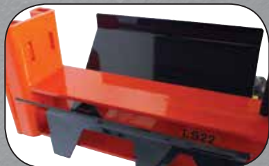
Log Splitter Cradle Kit P/N: 77622-00

A complete list of PARTS AND ACCESSORIES is on page 31