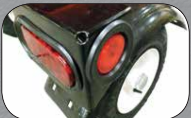
Fenders & Tail Lights Kit P/N: 77510-00