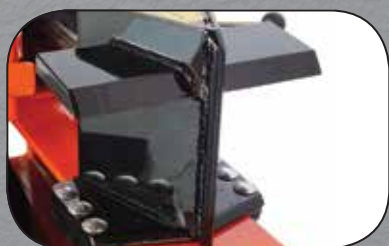
4-Way Wedge Kit P/N: 77514-00