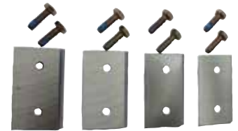
Chipper Blade Kit P/N: 72493 Model: CH500H