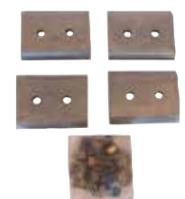
Chipper Blade Kit P/N: 76293-00 Model: CH800H