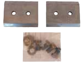
Chipper Blade Kit P/N: 76295-00 Model: CH450H