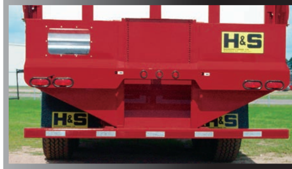
An optional grain hopper gravity unload for small grains is available for wide body boxes with a top hinged gate.