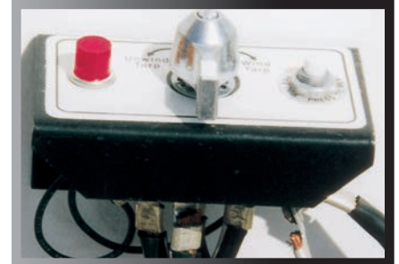
The optional front-to-rear electric roll tarp is a nice feature to keep that valuable forage from blowing out during transport.

Warranty: See operators manual for warranty details and limitations. H&S reserves the right to change its products or the description at any time without notice or obligation.