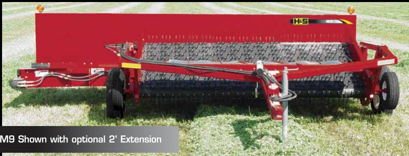
M9 Shown with optional 2' Extension

The optional 2' extension allows you to merge up to 14' cuts of hay windrowed up to 9' on the M9 Merger.