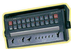
Raven® 450 sprayer control system