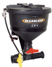
7 gallon chemical eductor is optional