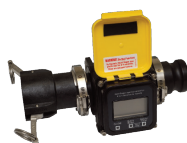
2" Flow Meter with digital display