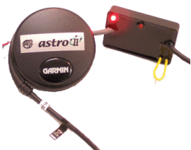
Astro II GPS Speed Sensor for use with Raven® 450 is optional