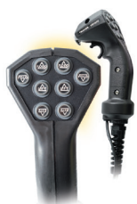
Pendant boom control with live hydraulic front fold models