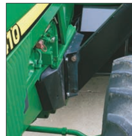
Quick Attach adapter brackets