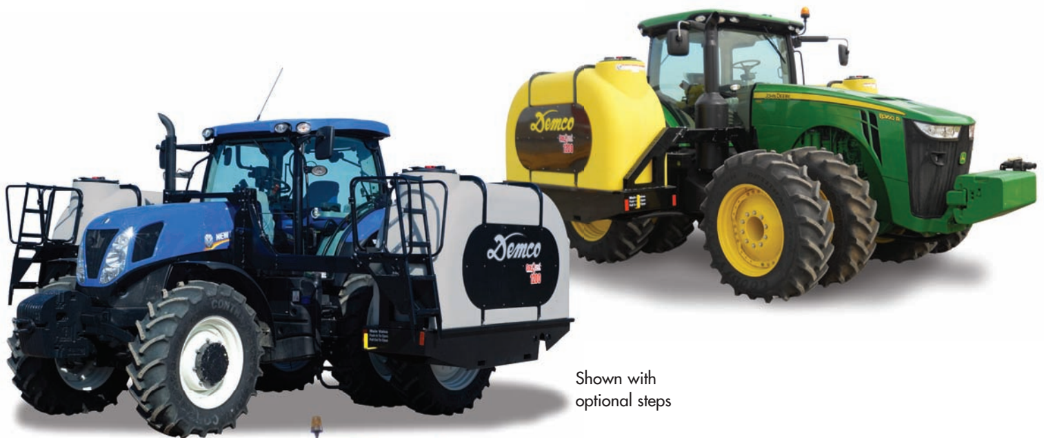
Shown with optional steps