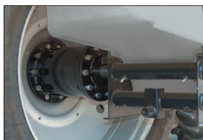
New 10 Bolt Hub Side mounts allow high or low clearance installation. (On nontrack units)