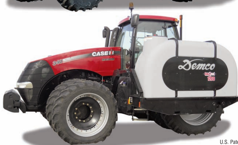
U.S. Patent No. 6,286,870