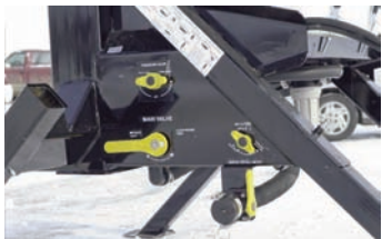
Easy access controls