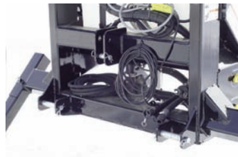
Fit category II or III 3 point hitch