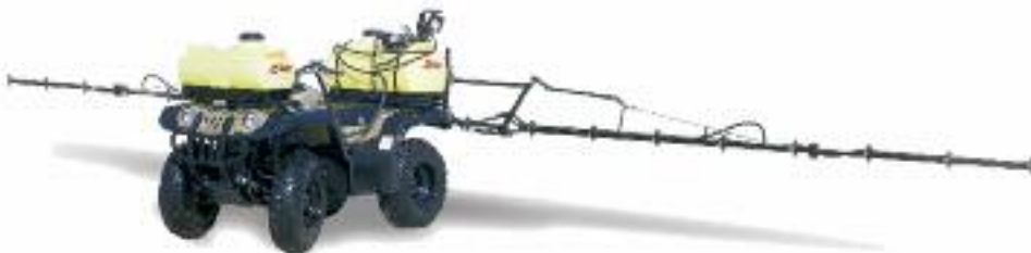
14 & 25 gallon ATV Sprayers