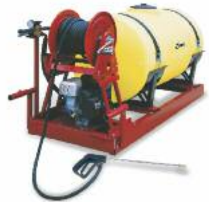
110 & 150 gallon skid sprayers