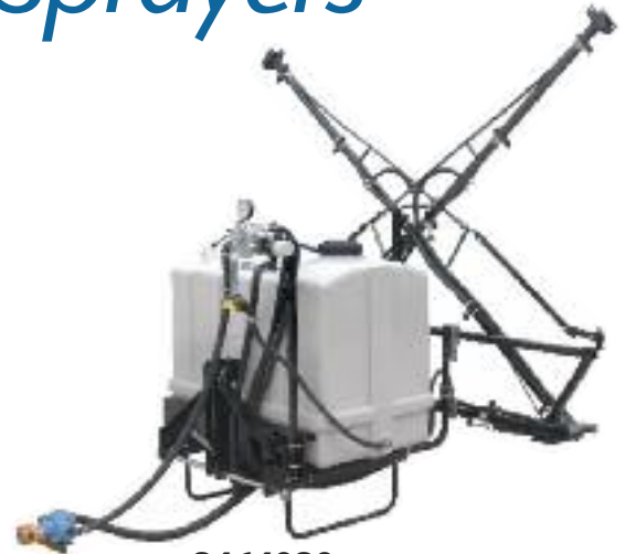
9464090 Rear mount with PTO pump