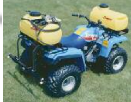
SM14 HYMB 80B10