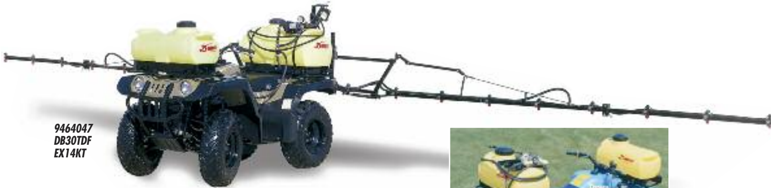
9464047 DB30TDF EX14KT