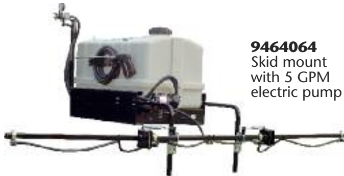
9464064 Skid mount with 5 GPM electric pump