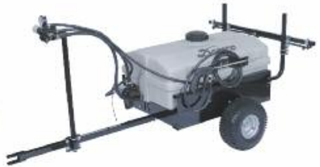
40, 60, & 80 gallon sprayers available as trailer, rear mount or skid