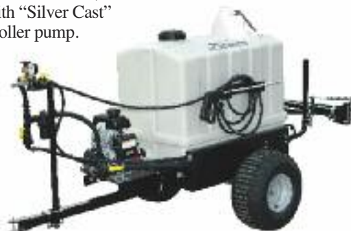
9464104 DB12 Trailer with Ace centrifugal pump and 3 HP Honda engine