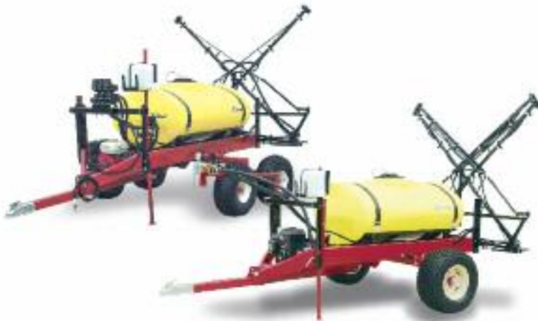
150 & 200 gallon ATV sprayers