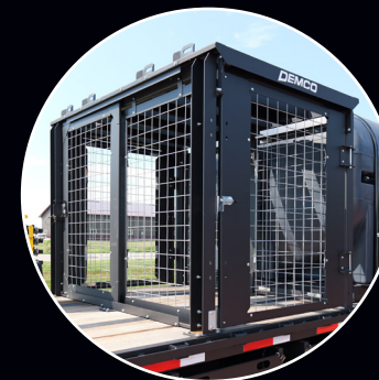
TOTE RACK / CAGE