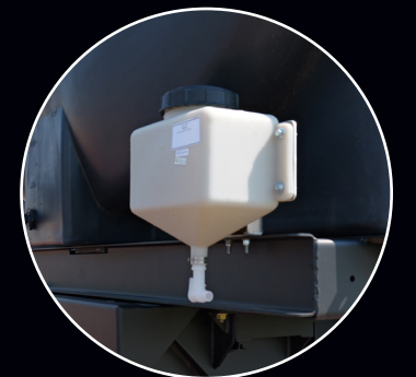
HAND WASH STATION