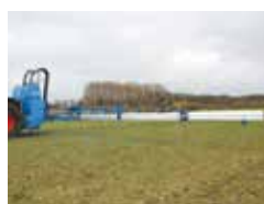
Mounted field sprayers