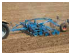
Compact disc harrows