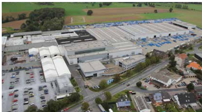
LEMKEN in Alpen/Germany

As professional crop production specialists, LEMKEN is one of the leading companies in Europe, with over 1,100 employees worldwide, achieving sales revenues of more than EUR 360 m. Originally founded in 1780 as a blacksmith's forge, the family company produces high-quality and high-performance farm machinery for soil cultivation, sowing and plant protection at its German headquarters in Alpen and at its two other production sites in Föhren and Meppen. 72 percent of the approximately 17,200 machines per year are exported.