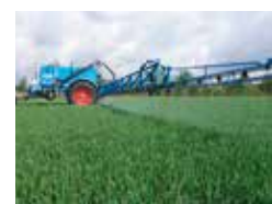
Trailed field sprayers

LEMKEN GmbH & Co. KG Weseler Straße 5 46519 Alpen Telefon +49 2802 81 0 Telefax +49 2802 81 220 lemken@lemken.com www.LEMKEN.com