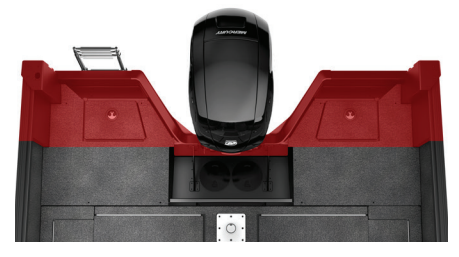
The seamlessly integrated Rotax S means more usable space on the boat with all the benefits of a traditional outboard. And with no exposed rigging hanging off the transom, the Rotax S takes safety