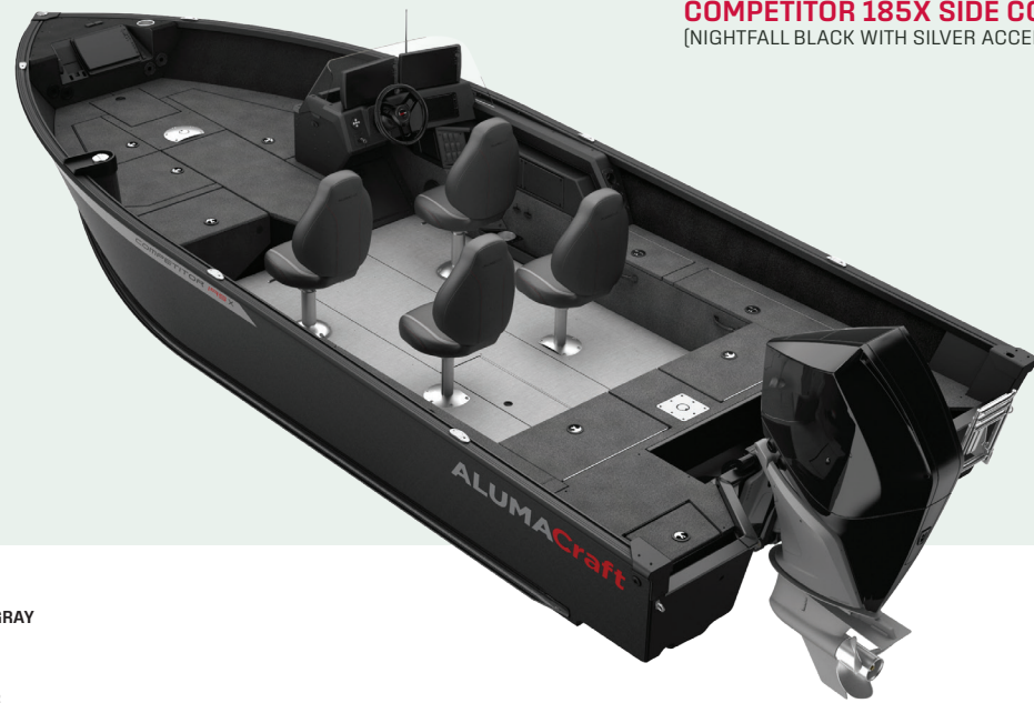
COMPETITOR 185X SIDE CONSOLE (NIGHTFALL BLACK WITH SILVER ACCENT)